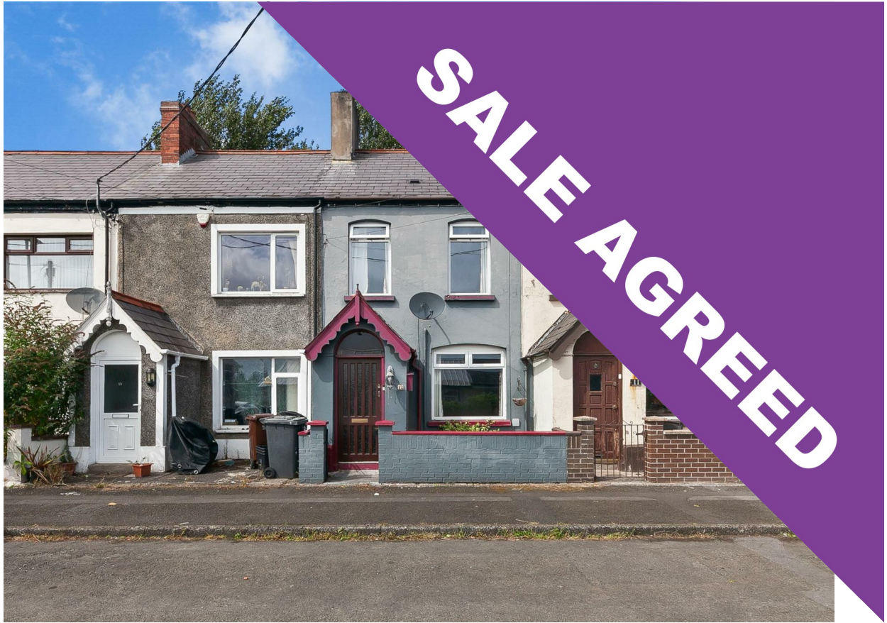
12 Fairymount Terrace, Carrickfergus, BT38 7HN